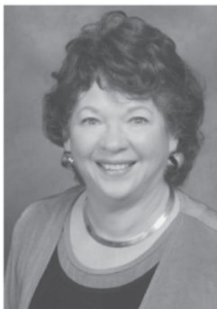
Broker Associate, DRE # 00608658

Helping my Real Estate clients connect to the Jewish Community since 1977